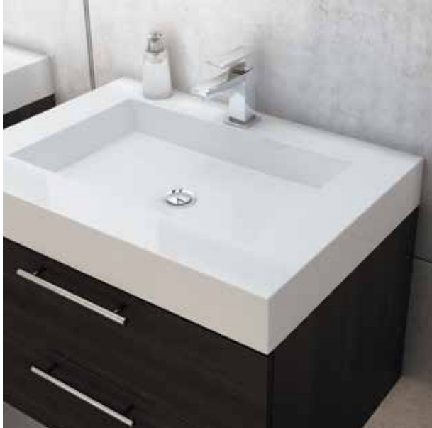
WISH series perfect-fit sink on 30", 48" or 60" vanities