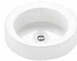
ZEN 180 contemporary style