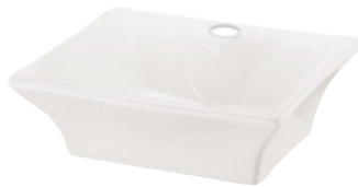
TORINO transitional style