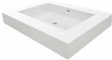
WISH S30 contemporary style

WISH SERIES PERFECT-FIT SINKS FOR 30", 48" OR 60" WIDE VANITIES (NO COUNTER NECESSARY)