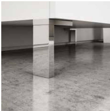
LEG-MOUNTED VANITY For a roomy decor with clean lines