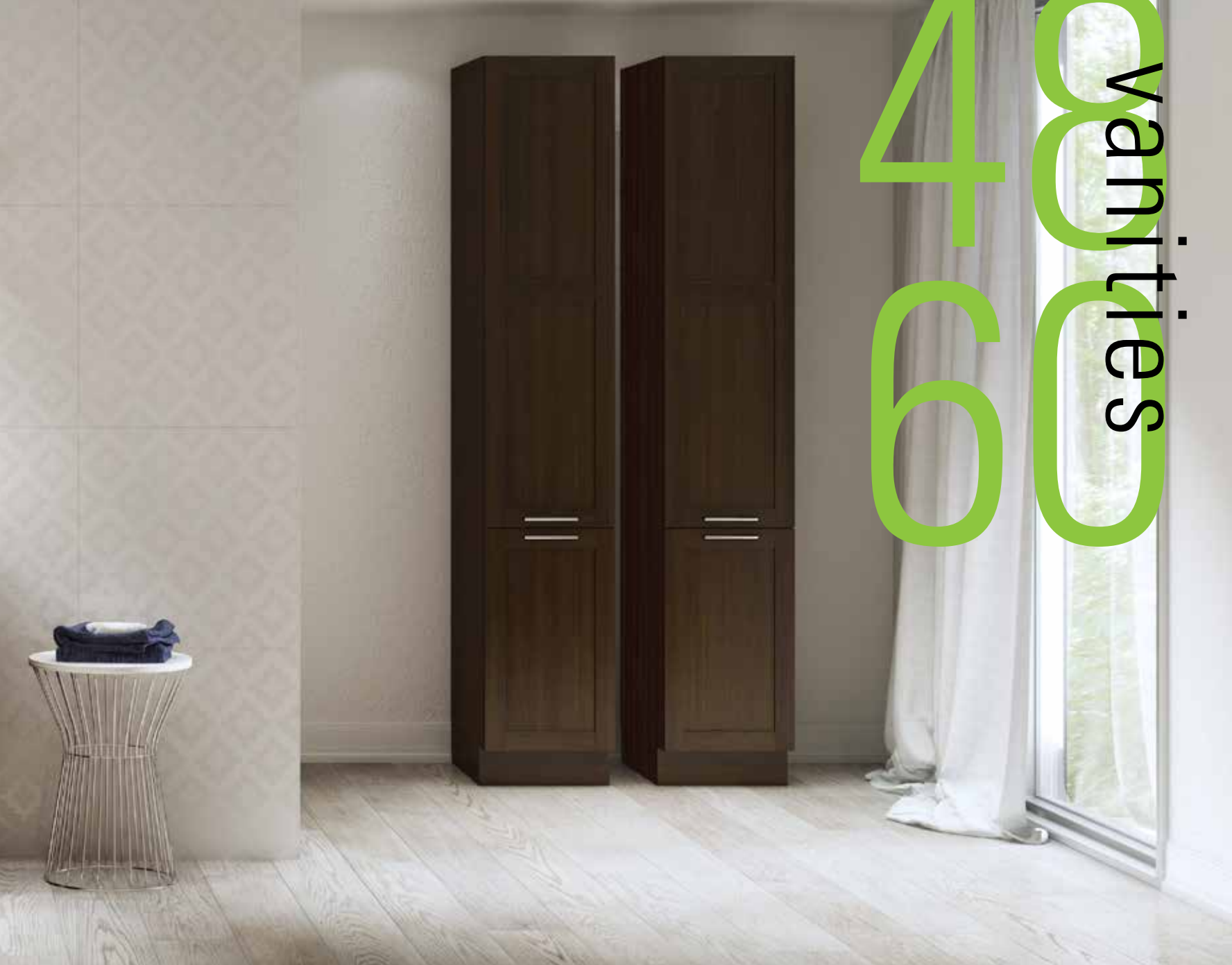
FREDDO transitional style 48 inches