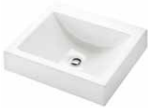
ZEN 19R contemporary style