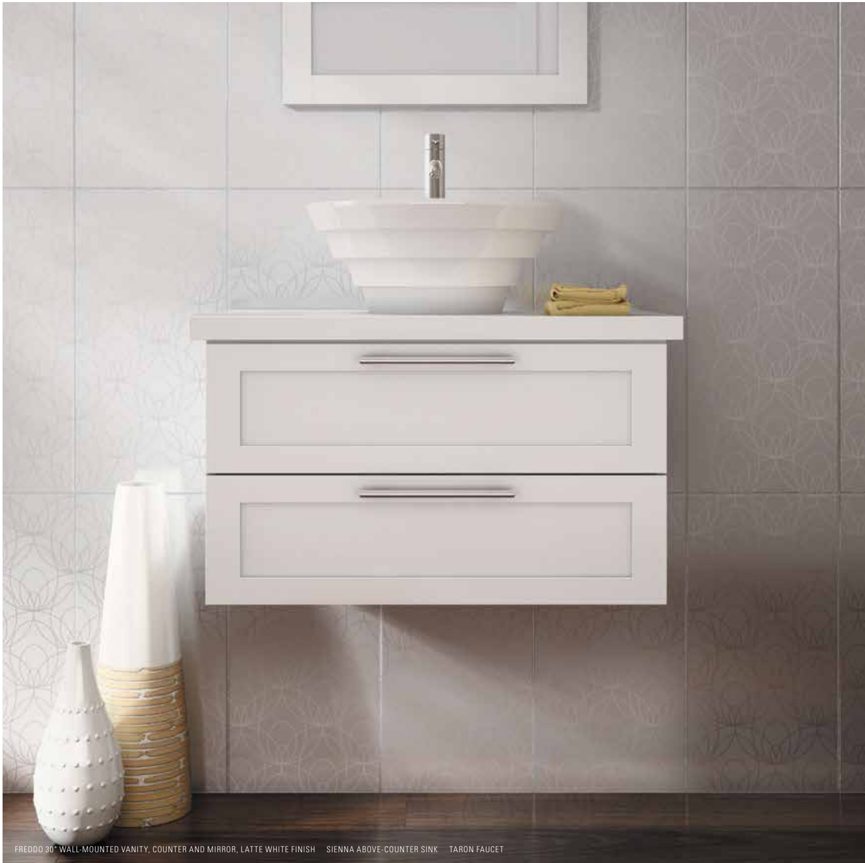
FREDDO 30" WALL-MOUNTED VANITY, COUNTER AND MIRROR, LATTE WHITE FINISH | SIENNA ABOVE-COUNTER SINK | TARON FAUCET