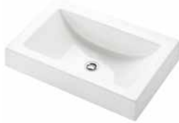
ZEN 25R contemporary style