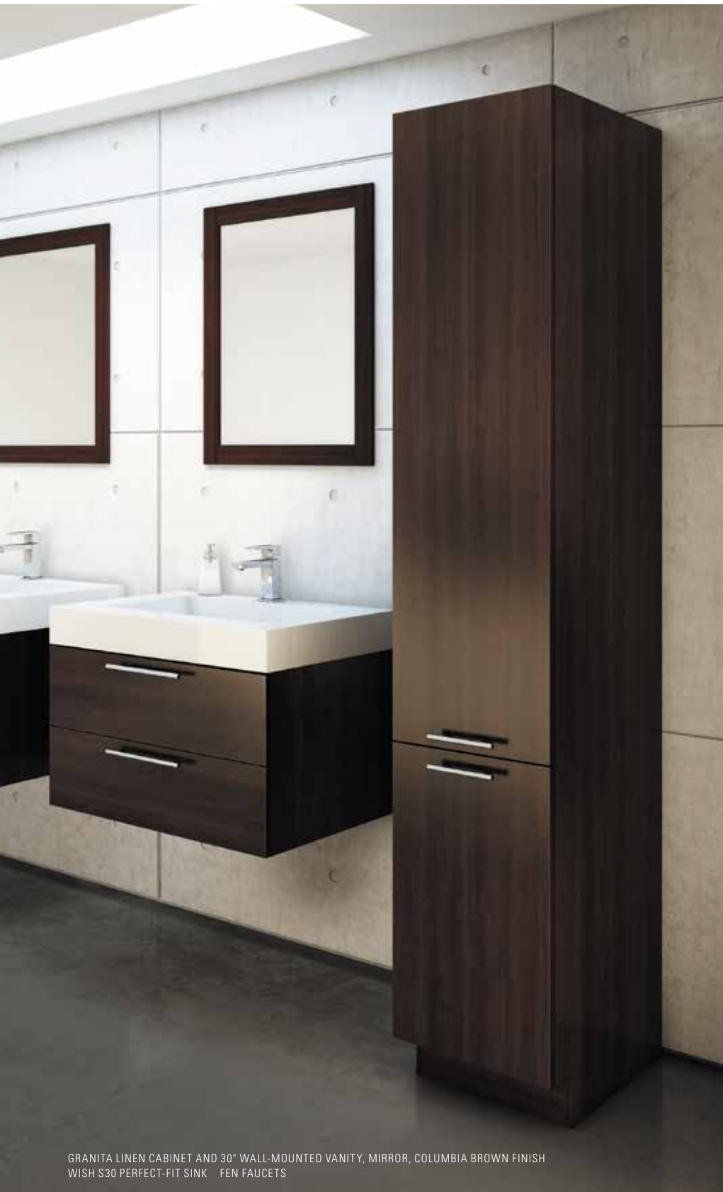
GRANITA LINEN CABINET AND 30" WALL-MOUNTED VANITY, MIRROR, COLUMBIA BROWN FINISH WISH S30 PERFECT-FIT SINK FEN FAUCETS