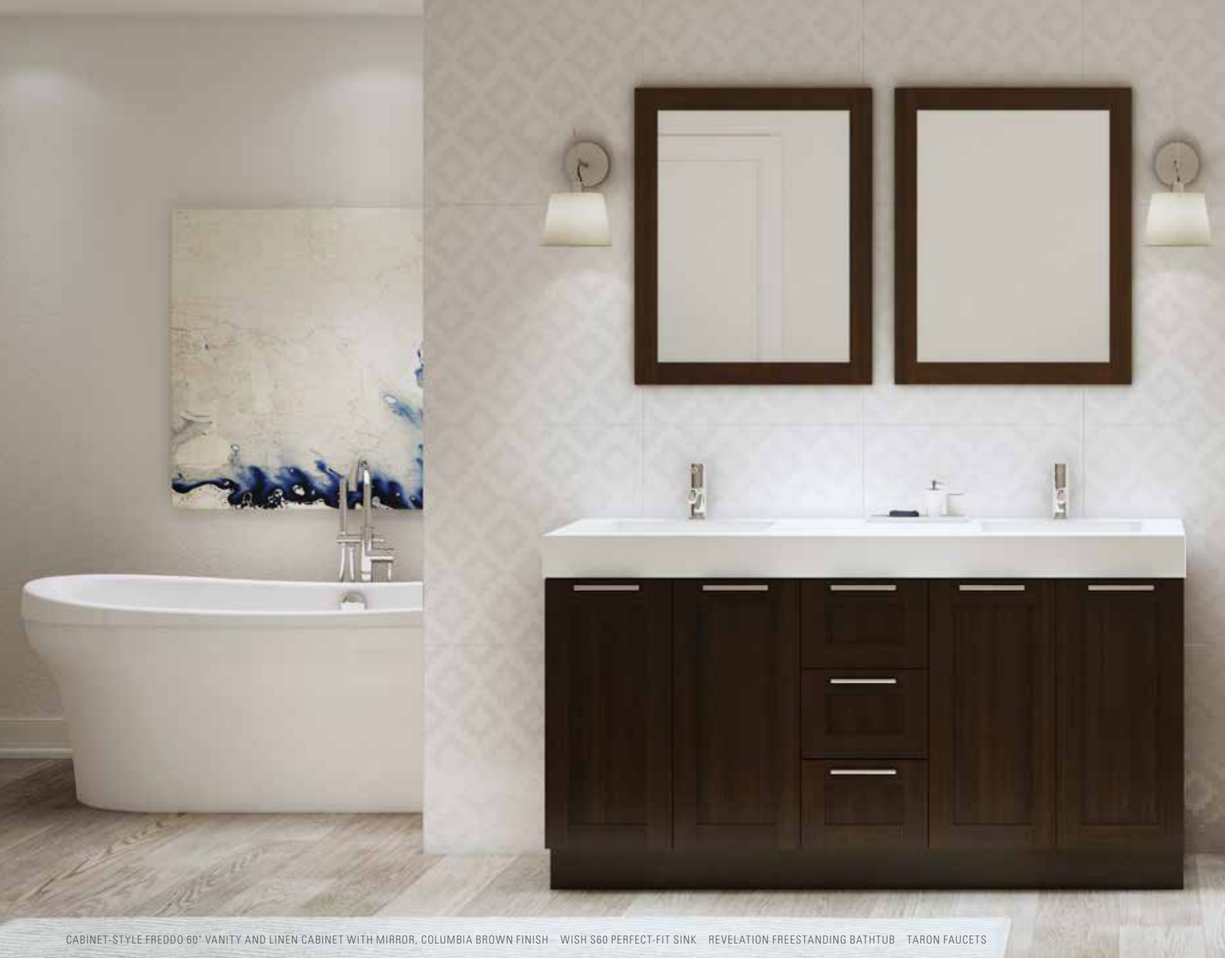
CABINET-STYLE FREDDO 60" VANITY AND LINEN CABINET WITH MIRROR, COLUMBIA BROWN FINISH WISH S60 PERFECT-FIT SINK REVELATION FREESTANDING BATHTUB TARON FAUCETS