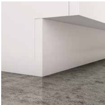
CABINET-STYLE VANITY For a classic and functional style