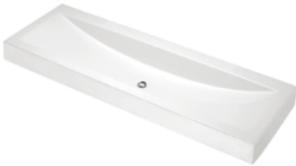
ZEN 50R contemporary style