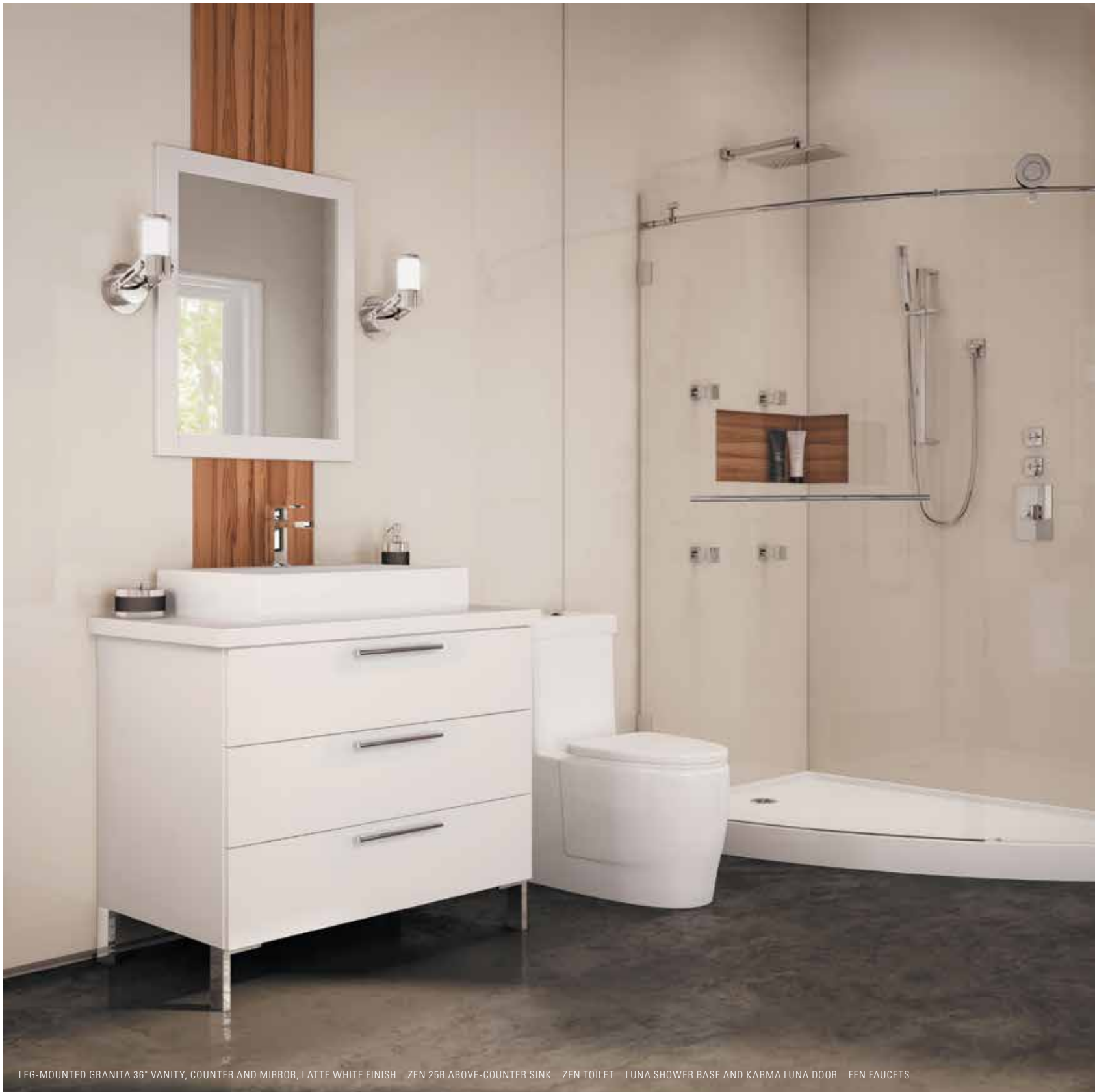
LEG-MOUNTED GRANITA 36" VANITY, COUNTER AND MIRROR, LATTE WHITE FINISH ZEN 25R ABOVE-COUNTER SINK ZEN TOILET LUNA SHOWER BASE AND KARMA LUNA DOOR FEN FAUCETS