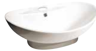
NAPOLI transitional style